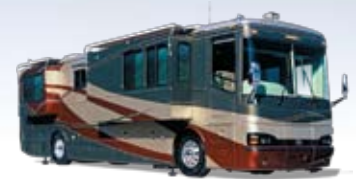
Bus/Class A Motor Home