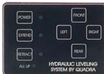
NEW EZE Controls