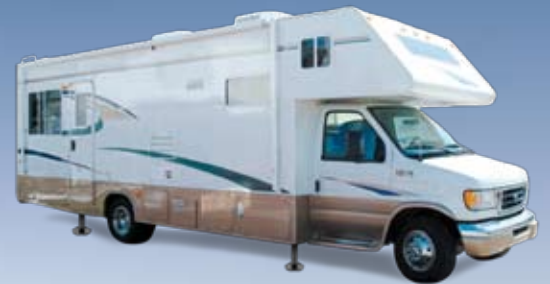
Class C Motor Home