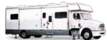
Class 8 Truck